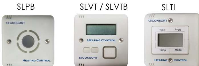
SL wireless controllers

Reasonable care has been taken to ensure that this guide is accurate at the time of printing. In the interest of progress, the Company reserve the right to vary specifications from time to time without notice.