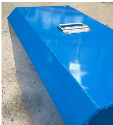
Contoured stylish design