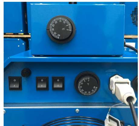
Easy to use controls, including fan & heat settings, over temperature reset and remote thermostat port

Customer Order Line 01527 830610 Technical Advice 01527 830616 E: sales@broughtoneap.co.uk F: 01527 527558