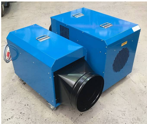
FFHT32 compared to the FF29