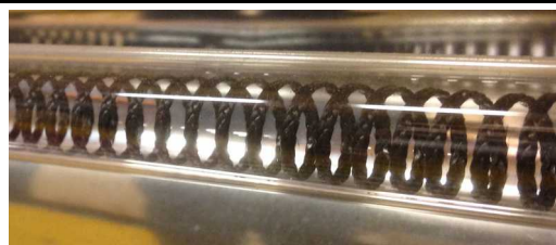
New carbon fibre filaments offers unrivalled strength...