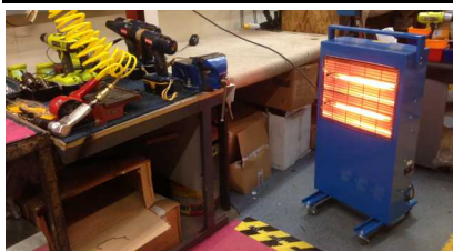
Ideal for a host of industrial applications