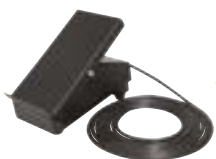
JFC-05 Foot Control Unit