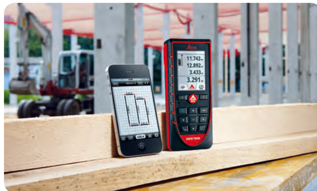
Data transfer with Bluetooth® Smart