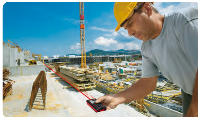
Measure long distances