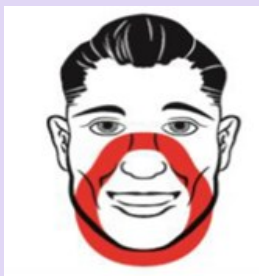
Figure 4: Example showing the face seal region (underneath the red line) that must be clean shaven for a half mask or Filtering Face Piece (FFP)

Research carried out by the HSE has demonstrated that protection could be significantly reduced where stubble or facial hair was present in the seal area. 11